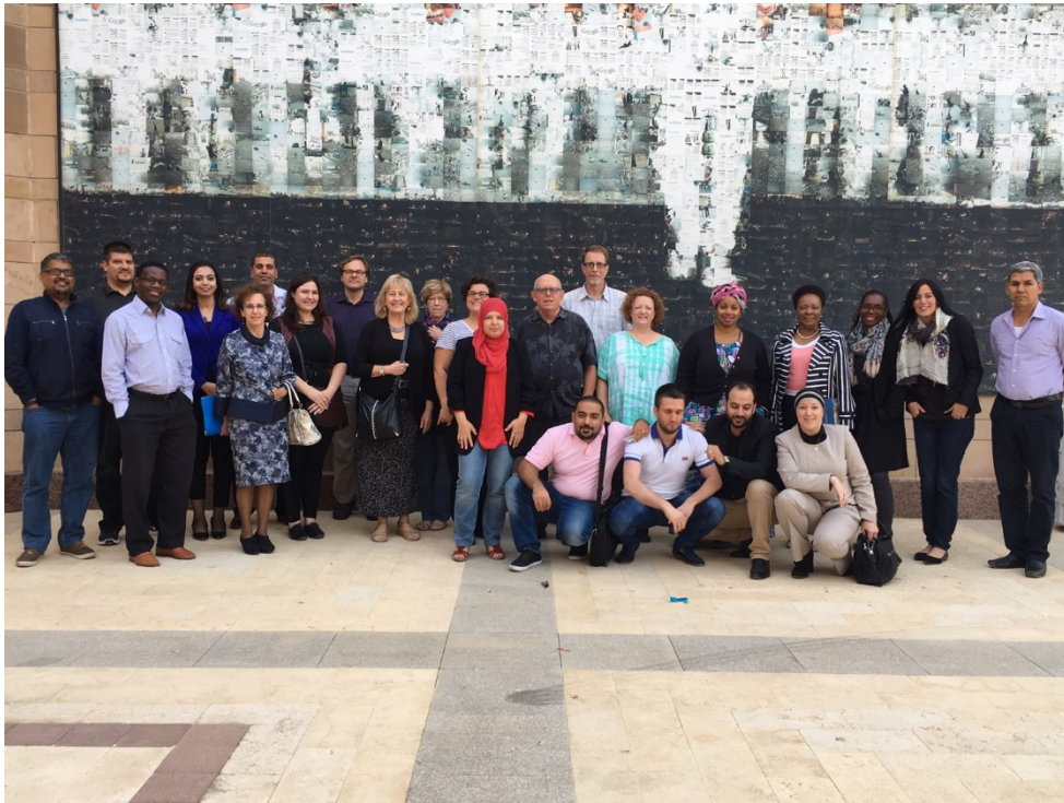
STEVENS INITIATIVE COIL WORKSHOP PARTICIPANTS VISIT CAIRO, EGYPT