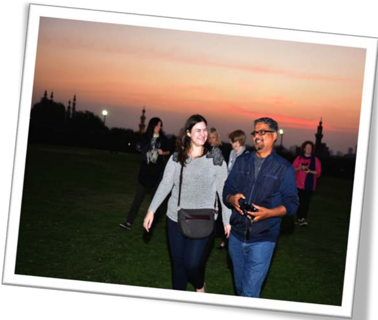
Pictured above: Several of the November 2016 SUNY COIL Stevens participants touring at Al-Azhar Park in Islamic Cairo on the second day of the workshop.