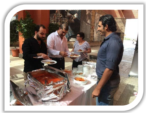
Pictured above: Participants eating Koshary, a traditional Egyptian dish made of three kinds of pasta, lentils, chickpeas, and tomato sauce.

adventure. Participants used this time to bond at the hotel over strong Egyptian coffee and shisha, or explore the city. A large party adventured to the Khani-Khalili souq in Islamic Cairo while others explored New Cairo mega-malls and the cosmopolitan gathering places of the Cairene elite. A troupe embarked in the early morning hours to see the Pyramids of Giza, while others used the in-house spa to indulge in the ancient Middle-Eastern practices of cupping and reflexology.