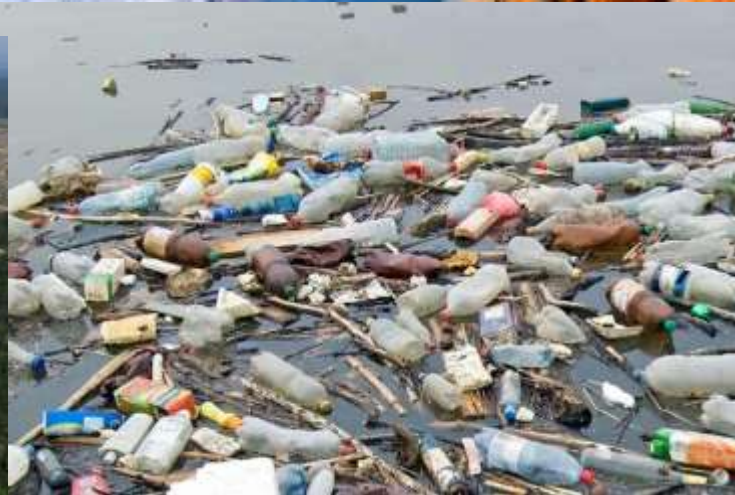
Chemical & Plastic pollution