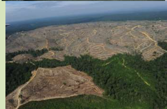
Deforestation y fragmentation